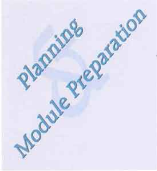
Planning Session Chaired by Director, DHSE